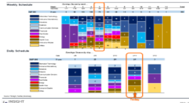
#3: S&P 500 Earnings Calendar