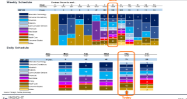
#3: S&P 500 Earnings Calendar