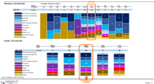
#3: S&P 500 Earnings Calendar